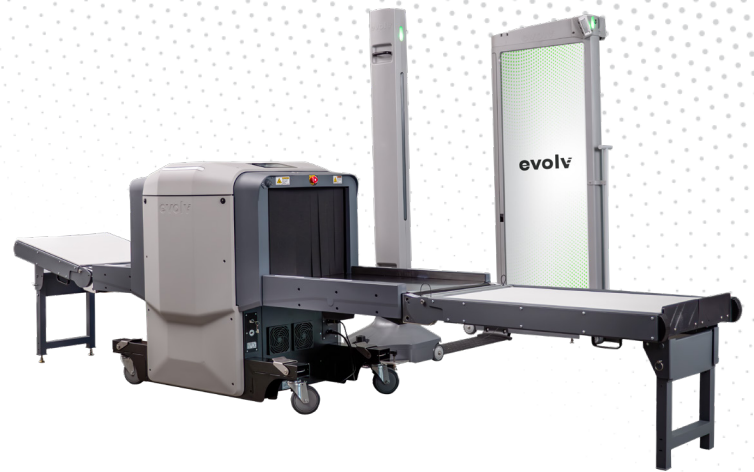
This image is for illustration purposes only and may be updated or modified.

Using Evolv eXpedite in conjunction with Express aims to allow Express to run at a higher sensitivity level with the goal to keep false alarm rates (FAR) low. This means that the combined solution is designed to detect more threats without putting an excess burden on security teams.