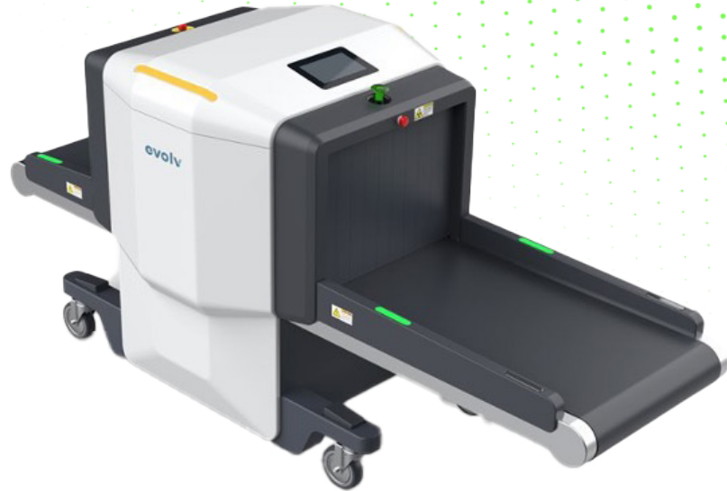
This image is for illustration purposes only and may be updated or modified.